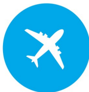
Travel Bursary Award