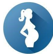
Trauma in Pregnancy